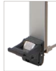
COMPACT PCI and VME64x