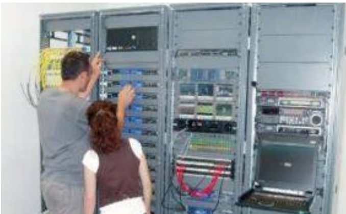
Ratiopac PRO for satellite communication.