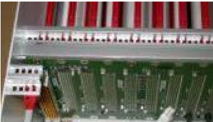
Ratiopac PRO as advanced test device.