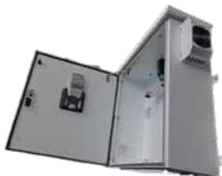
Passive or actively cooled solutions