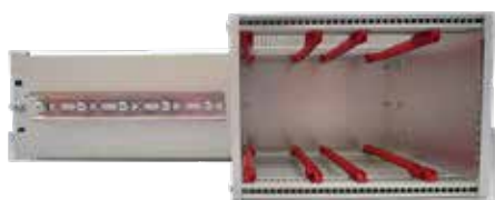
19" DIN rail mounted subracks integrated into wallmount enclosure

Our solutions improve end-user safety and help our customers enhance the safety of their operations.