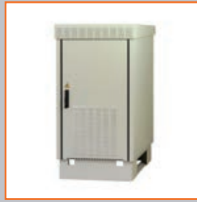
Power distribution & High voltage detection

EN15085/AWS, EN45545, Door Opening up to 180° with locking latch. Wall and Pole mount options available. Aluminium, Mild and Stainless Steel. Cooling options include: passive and active.