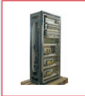
On board Cabinet 10-40U Space saving swing frame option