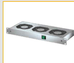
Smart cooling fan tray