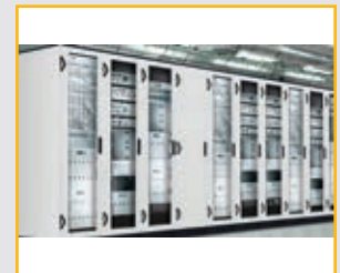
Signalling & Passenger information systems