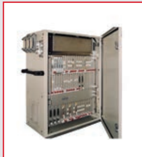
European Train Control System / Vehicle On Board Computer