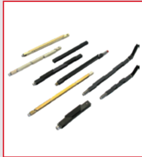
Ruggedized card retention up to 40G