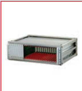
Space saving mounting frame for subrack system.