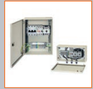
Wi-fi, Access point, Fiber splicing, Wall & Pole mount options, Full Integration Service