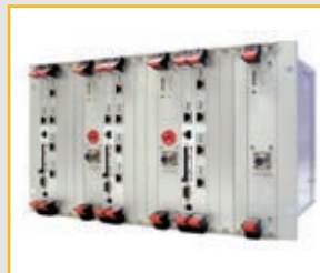
Interlocking Trackside CPCI

EN15085/AWS, EN45545, Door Opening up to 180° with locking. Wall and Pole mount. Aluminium, Mild and Stainless Steel. Cooling options include: passive and active.