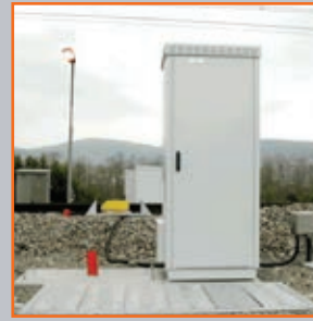
Axle counter, zone controller, wheel T°, track maintenance, interlocking.