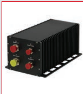
Conducted cooled With IP65 Integrated PSU & CPCI Backplane also communication BUS, also available to AAR specification