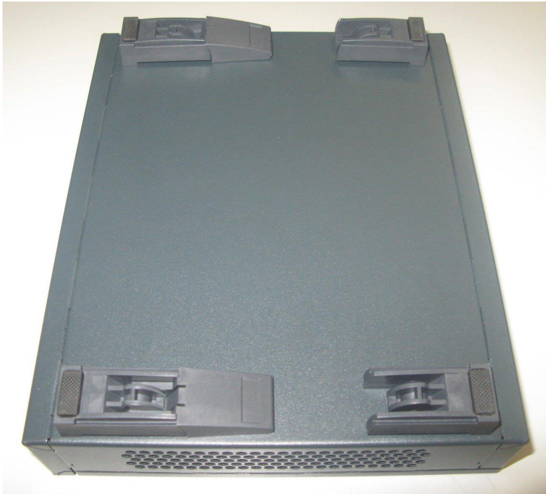
Interscale M with tip-up feet