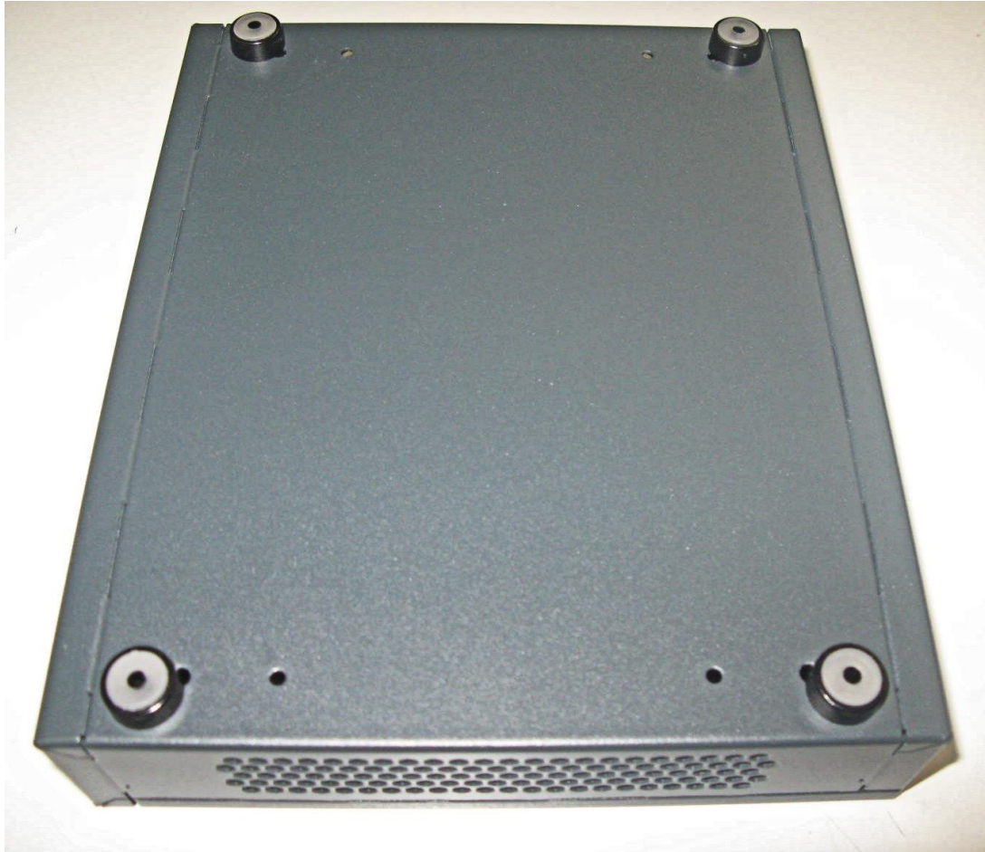
Interscale M with normal feet