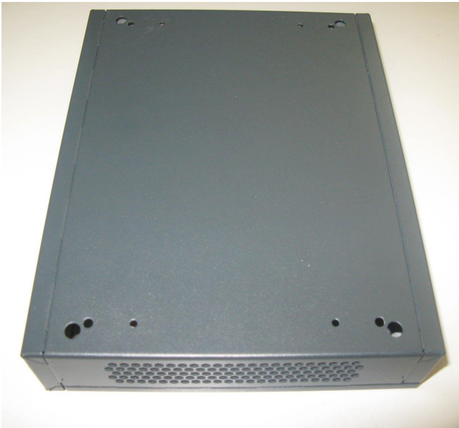
Interscale M without any feet