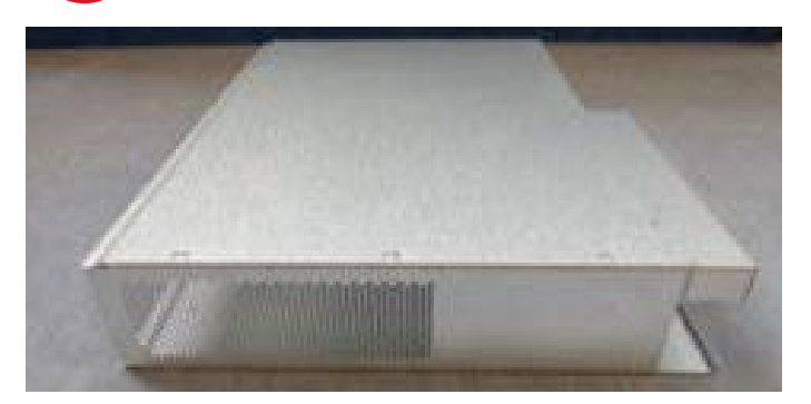
Multipac PRO for machine to machine communication.