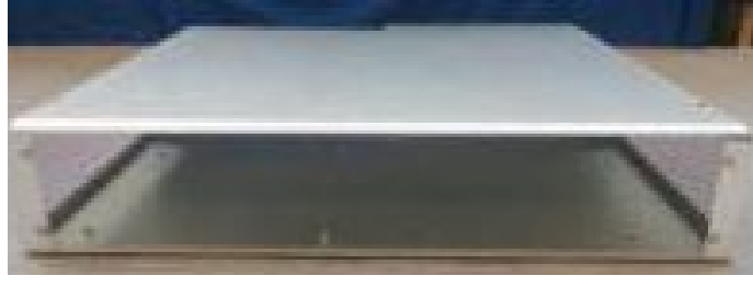
Multipac PRO insertion. Chassis has special cover shape and special floor according to specific application of customer. Machined and printed on front panel.