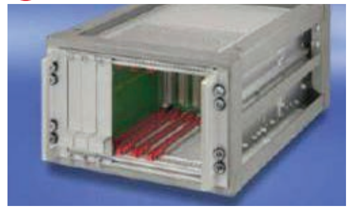
The subrack and the receptacle must fulfill the shock and vibration requirements.