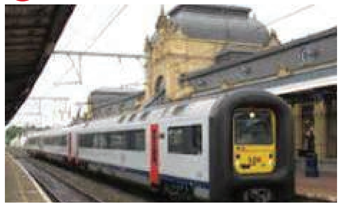
Railway companies need a housing for their PCB applications based on the 19" standard and the French railway standard.