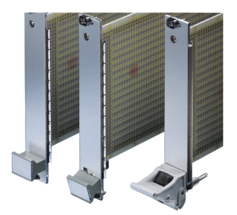
Fig 6: Plug-in unit shielded with EMC spring gasket