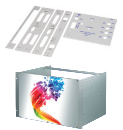
Fig. 3: Front panel design to customer specifications: Single or multiple colors

Aluminum U-profile front panels are also suitable for EMC applications. A textile mesh EMC gasket is applied to one side, which is much quicker than clipping in stainless-steel gaskets. Textile gaskets are also cheaper. Because of their U-shape, these front panels are very robust, which is advantageous for 6 U-high covers. When connecting or removing a plug-in unit, the U-shape prevents the front panel from flexing and therefore reduces the risk of warping the printed circuit board. This also reduces the "stress" on the electronic components.