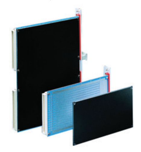
Fig 7: Printed board cover for mechanical solder side protection

Stainless-steel or textile EMC gaskets can also be applied as per the customer's request. Frame-type plug-in units are also delivered pre-configured with various accessories or additional components, such as small, even non-standardized backplanes or cabling, if requested by the customer.