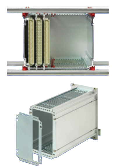
Fig. 2: Frame-type plug-in unit mounted in subrack (rear view)

Safety requirements are often the reason for integrating printed circuit boards in frame-type plug-in units. In addition, in the event of maintenance, they allow the technician to replace the unit on-site easily.