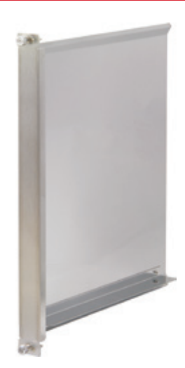
Fig 8: Plug-in unit/front panel with assembled air baffle

Ease of construction and assembly is also an important consideration when selecting front panels, plug-in units, or frame-type plug-in units. Normally these products can be supplied either in kits, i.e., as a parts kit, or fully assembled. When supplied as individual parts, the final product must be simple to assemble, without the need for costly special tools or large time investments because of instructions that are unclear or difficult to understand. It is desirable that the assembly of the entire mechanical structure of the front panel, plug-in unit, or frame-type plug-in unit be carried out using a basic single tool.