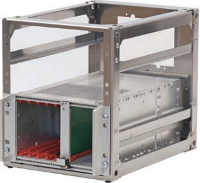
Lightweight OBR with a welded frame