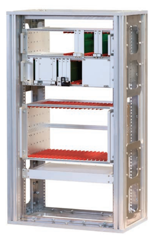
Vehicle OBR with a bolted aluminum frame